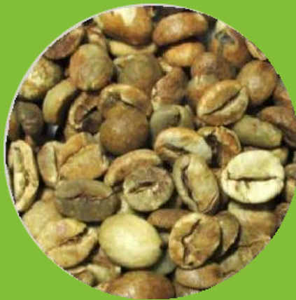
BALI KINTAMANI ROBUSTA ELB 350 BC