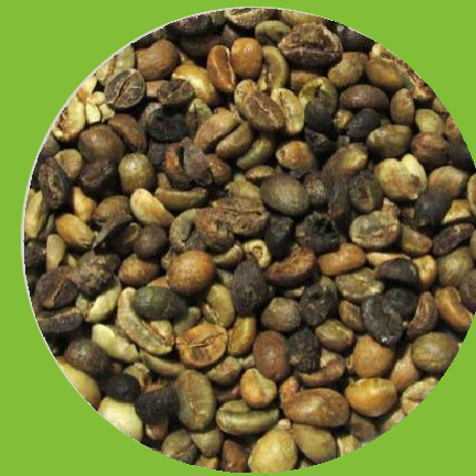
SIDIKALANG GRADE 4