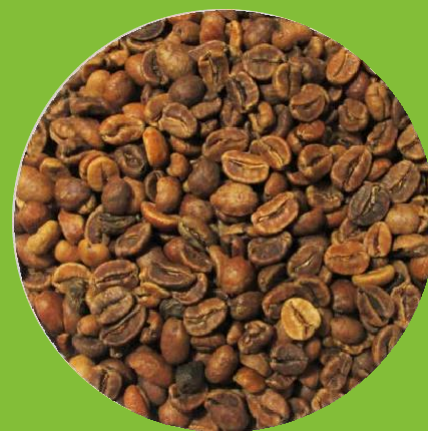
BALI, JAVA, GAYO AND MANDHELING WINE