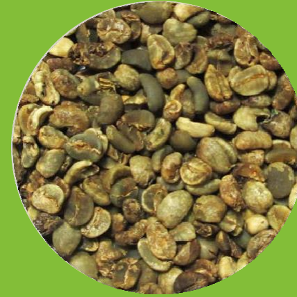
MANDHELING GRADE 3 SPECIAL