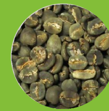
TORAJA GRADE 2