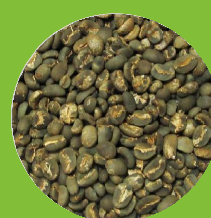
MANDHELING FTO GRADE 1