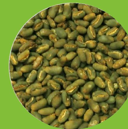
SUMATRA SUPER PEABERRY