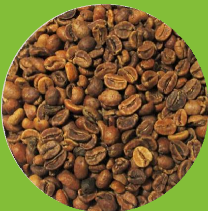
BALI, JAVA, GAYO AND MANDHELING WINE