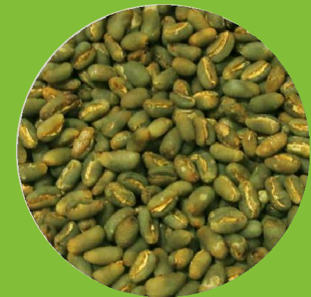
SUMATRA SUPER PEABERRY