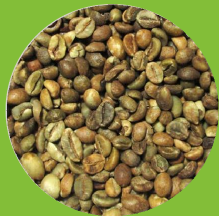
SIDIKALANG GRADE 2