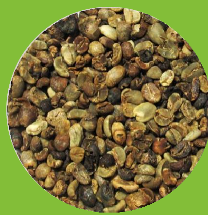
MANDHELING GRADE 5