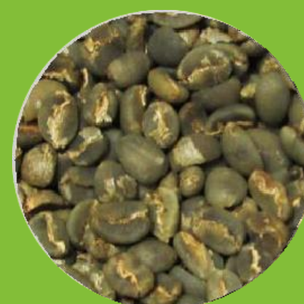
LINTONG GRADE 2