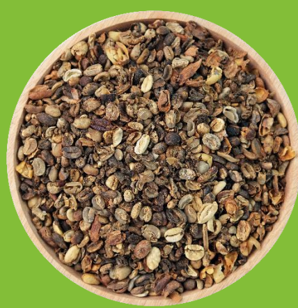
MANDHELING GRADE 6