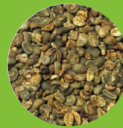
MANDHELING GRADE 3