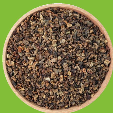
MANDHELING LOW GRADE/PIXEL