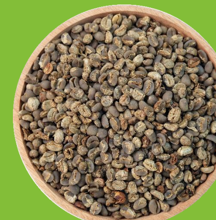
MANDHELING GRADE 2