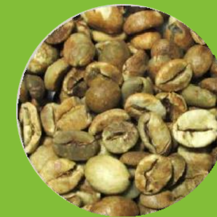
BALI KINTAMANI ROBUSTA ELB 350 BC