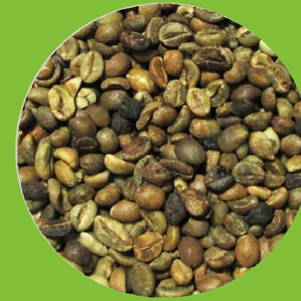
SIDIKALANG GRADE 3