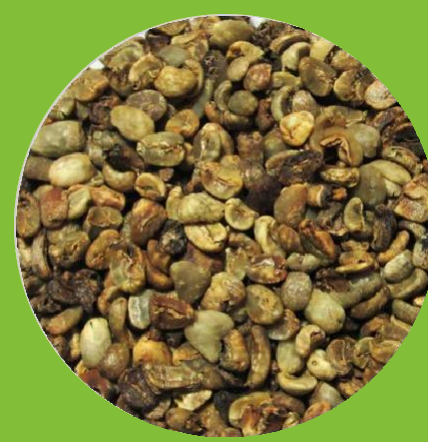
MANDHELING GRADE 4