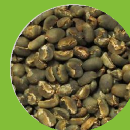
JAVA PREANGER GRADE 1