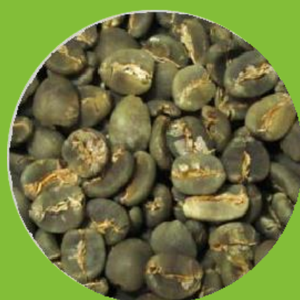
ACEH GAYO GRADE 2