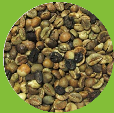
LAMPUNG GRADE 4