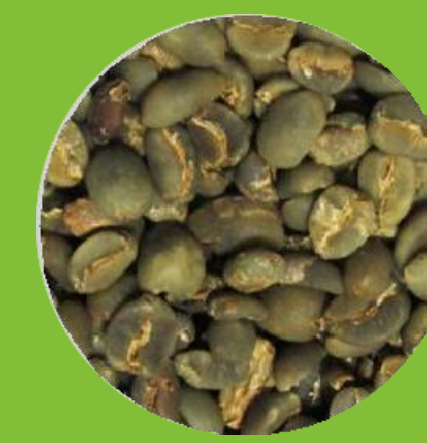
KALOSI GRADE 1