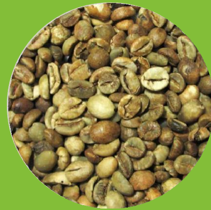
LAMPUNG ELB 350 BC