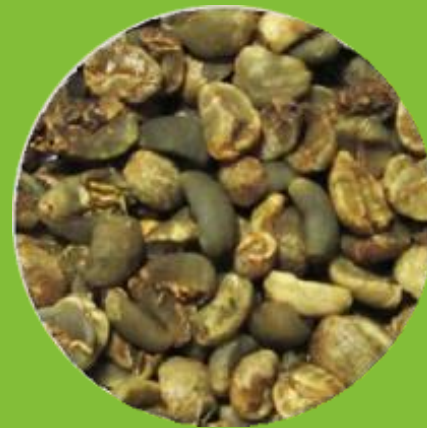
SUMATRA TIGER GRADE 3 SPECIAL