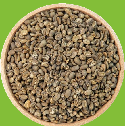
MANDHELING GRADE 1