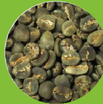
SUMATRA ARABICA ORGANIC GRADE 2