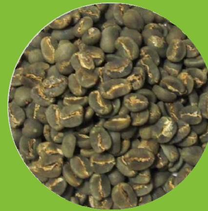
JUMBO EIGHTEEN PLUS