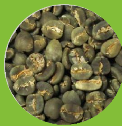
ORGANIC MANDHELING GRADE 1