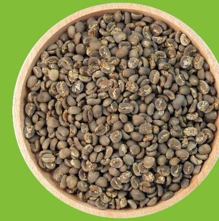
ELB GREEN DINO