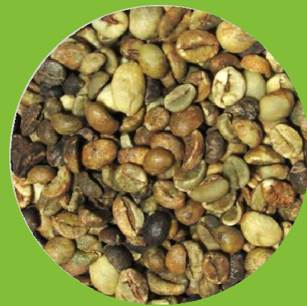
LAMPUNG GRADE 3