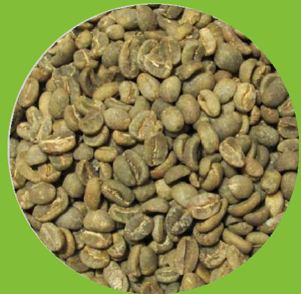
LUWAK (WILD CIVET ARABICA COFFEE)