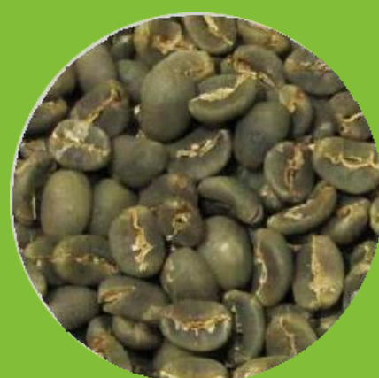
ACEH GAYO GRADE 1